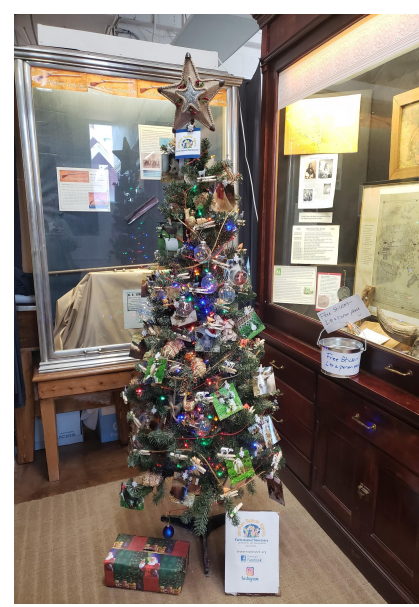
The Winner of "Best Decorated Tree" at this year's Christmas Village. Decorated by Broken Roads Ranch in Eden Valley