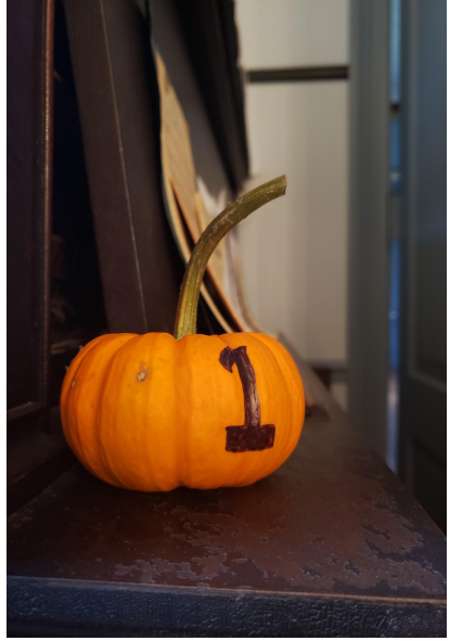
One of the pumpkins hidden during the Pumpkin Scavenger Hunt in October