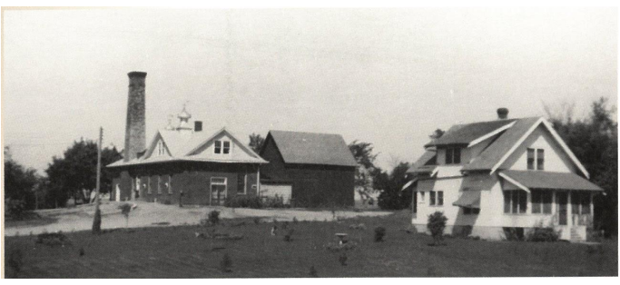
The Danielson Creamery in Rosendale, the 1st of its kind in Meeker county and possibly the state

Before 1920, nearly every town and township in the area had its creamery that farmers will sell their cream to. The variety of creameries was advantageous to the dairy farmers, who had a daily race against the clock to deliver the cream before it could spoil; but it wasn't helpful to the creameries themselves. Because of the competition with private butter sellers, cooperative creameries were often forced to accept all varieties of cream: clean or dirty, sweet or sour. If a creamery rejected a farmer's product, the farmer could easily sell it to a private creamery who would then pay up front