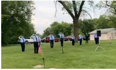
A screenshot of the livestream from the Paul F. Dille Post 364 Memorial Day Service. The program was closed to the public and livestreamed on Facebook.

Cosmos, Paul F. Dille Post 364 in Dassel, Eden Valley Post 381 in Eden Valley, Watkins Post 453 in Watkins, and the Johnson-Kelly Post 483 in Dassel.