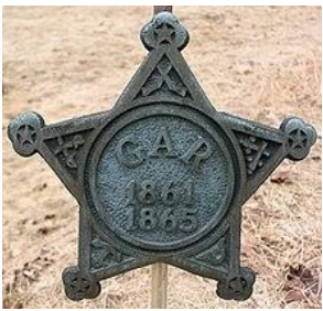
A G.A.R. grave marker, still placed near the graves of Civil War veterans on Memorial Day still today