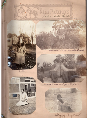
A page from the Memory Book, photos of LHS students