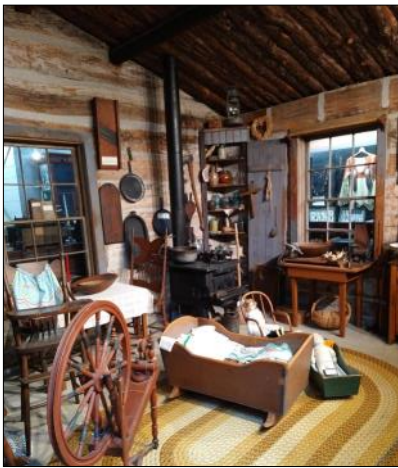
The 1868 cabin inside the Meeker County Museum.