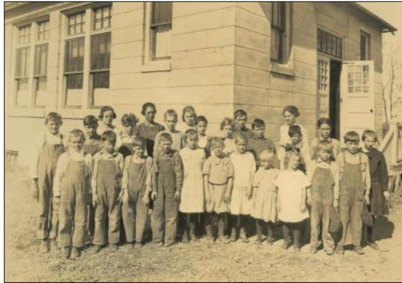
Rosendale School, District 50, c. 1930s

Various newspaper articles Meeker County Minnesota History Treasurer records, District 50