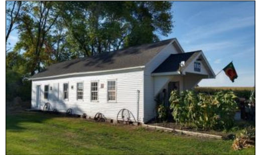
A present-day view of the original Rosendale school (with a later addition). It was later the Danielson Township Hall and is now an antique store.